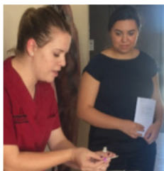
Azusa Pacific University School of Nursing student demonstrates to a resident how to collect a sample.