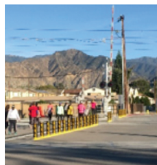
Residents begin a 3-mile hike up Dalton Ave. with the Azusa Walks Program.